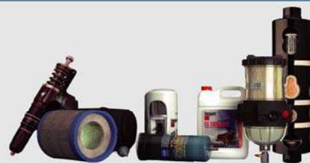
500 hours genset spare parts